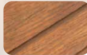
GOLDEN PINE WOOD